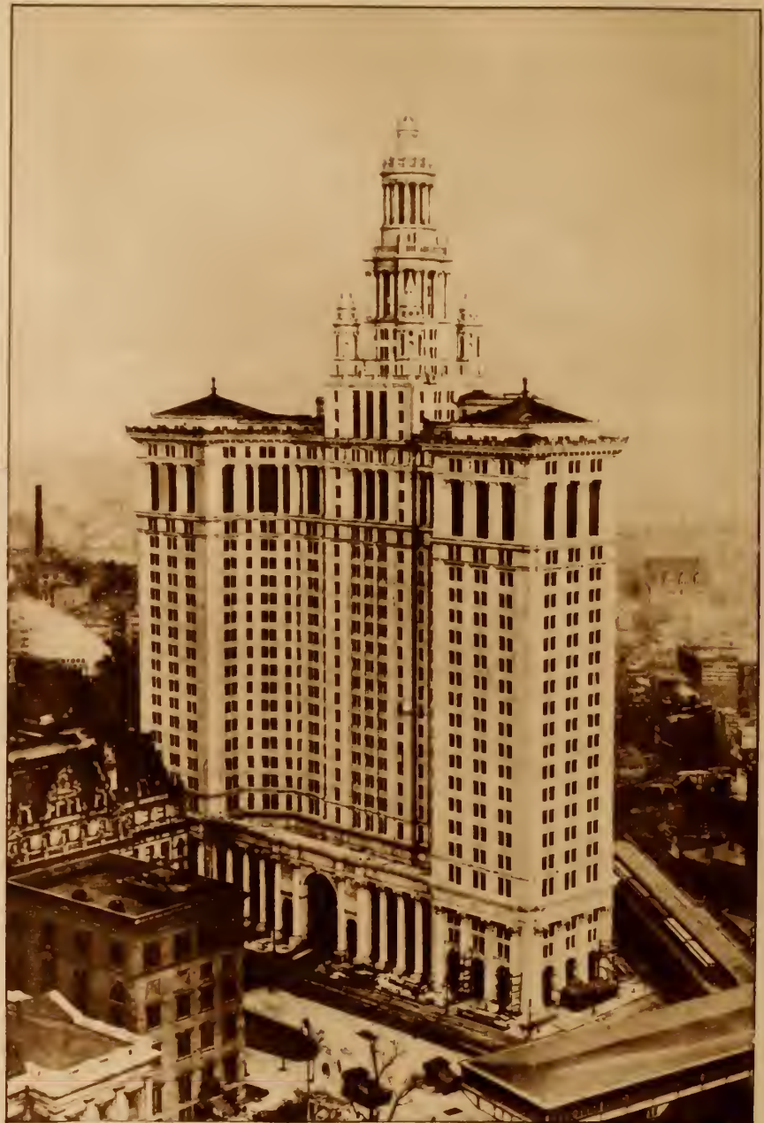
MUNICIPAL BUILDING. The home of New York City's Financial and other departments. In its basement there is a subway station, starting for many important routes.